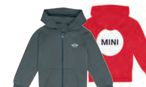
MINI WORDMARK CIRCLE ZIP HOODIE KIDS

100% cotton (organic), UV protection finish Sage/Multi-coloured 98-140 80 14 5A21638-45