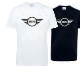
MINI TWO-TONE WING LOGO T-SHIRT MEN'S

100% cotton (organic) Sage/Multi-coloured S-XXXL 80 14 5A21589-94