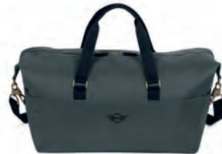
MINI TWO-TONE LOGO TRAVELLER BAG

Material: 100% cotton (waxed) Lining: 100% polyester Sage 80 22 5A51686 23 x 16 x 35 cm