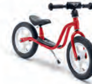
MINI BALANCE BIKE

Steel Chili Red 80 93 2451011 US: 80 93 2451010 34 x 38 x 87 cm