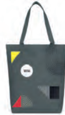
MINI GRAPHIC SHOPPER

Material: 100% cotton (waxed) Lining: 100% polyester Sage/Multi-coloured 80 21 5A51684 19 x 2 x 10 cm