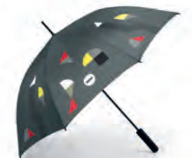
MINI GRAPHIC WALKING STICK UMBRELLA

100% polyester (recycled PET) Sage/Multi-coloured 80 23 5A51699 Closed: 27 x 6 cm Handle: 5 x 4 cm Diameter: 98 cm