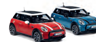
MINI COOPER S MINIATURE

Die-cast White Silver 80 43 5A21535 1:18 scale