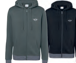
MINI STRIPED BINDING ZIP HOODIE MEN'S

95% cotton (organic) 5% elastane Sage S-XXXL 80 14 5A21617-22