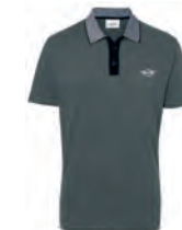
MINI STRIPED COLLAR POLO MEN'S

100% cotton (organic) White/Black S-XXXL 80 14 5A21603-08 Black/White S-XXXL 80 14 5A21610-15