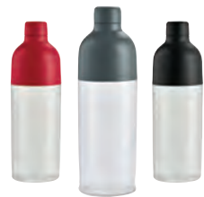
MINI COLOUR BLOCK WATER BOTTLE

Bar: Chrome-plated steel Silver/Black 80 93 2463105