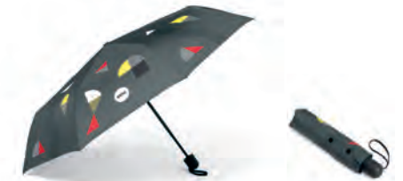
MINI GRAPHIC FOLDABLE UMBRELLA

100% polyester (recycled PET) Sage/Multi-coloured 80 23 5A51699 Closed: 27 x 6 cm Handle: 5 x 4 cm Diameter: 98 cm