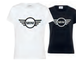
MINI TWO-TONE WING LOGO T-SHIRT WOMEN'S

100% cotton (organic) Sage/Multi-coloured XXS-XL 80 14 5A21554-59