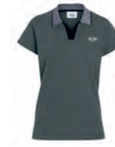
MINI STRIPED COLLAR POLO WOMEN'S

100% cotton (organic) White/Black XXS-XL 80 14 5A21561-66 Black/White XXS-XL 80 14 5A21596-601