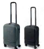
MINI CABIN TROLLEY

Material: 100% cotton (waxed) Chili Red 80 21 5A0A662 Black 80 21 5A0A663 8.5 x 8.5 x 0.4 cm