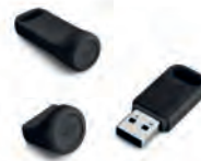
MINI USB KEY

Stoneware Sage/Multicoloured 80 28 5A51697 Capacity: 0.3 l