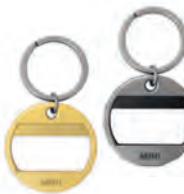
MINI COLOURED BOTTLE OPENER KEYRING

Anodised aluminium, satin finish Black/Silver 80 24 2460900 13 x 1.2 x 1.2 cm