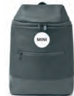
MINI WORDMARK CIRCLE BACKPACK

Material: 100% cotton (waxed) Lining: 100% polyester Sage/Multi-coloured 80 22 5A51685 45 x 27 x 27 cm