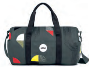
MINI GRAPHIC DUFFLE BAG

Material: 100% cotton (waxed) Sage/Multi-coloured 80 22 5A51683 40 x 40 x 14 cm