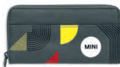
MINI GRAPHIC WALLET

Material: 100% cotton (waxed) Lining: 100% polyester Sage/Multi-coloured 80 21 5A51682 20 x 11 cm