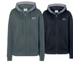
MINI STRIPED BINDING ZIP HOODIE WOMEN'S

95% cotton (organic) 5% elastane Sage XXS-XL 80 14 5A21568-73