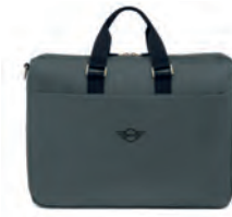
MINI TWO-TONE LOGO LAPTOP BAG

Material: 100% polyester (recycled PET) Lining: 100% polyester Sage/Black 80 22 5A51687 26 x 3 x 13 cm