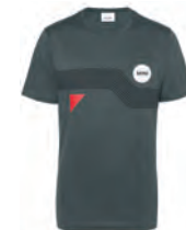
MINI GRAPHIC WORDMARK T-SHIRT MEN'S

100% cotton (organic) Sage/Multi-coloured S-XXXL 80 14 5A21589-94