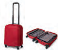
MINI KIDS TROLLEY

Wing logo: debossed Shell: 100% polycarbonate Lining: 100% polyester Sage 80 22 5A51691 Black 80 22 5A0A671 71 x 48.5 x 27.5 cm Volume: 76 l