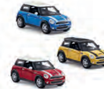
MINI COOPER S PULL BACK

95% cotton, 3% polyester, 2% viscose Chili Red 80 45 2454546 26 x 14 x 13 cm