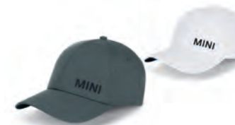
MINI TWO-TONE WORDMARK CAP

100% cotton (organic) Sage S-XXXL 80 14 5A21624-29 Black S-XXXL 80 14 5A21631-36