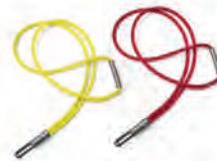
MINI TUBE LANYARD

ABS with rubber finish, 32 GB Black 80 29 5A0A693 1.8 x 1.8 x 4.5 cm