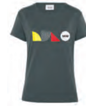
MINI GRAPHIC WORDMARK T-SHIRT WOMEN'S

100% cotton (organic) Sage/Multi-coloured XXS-XL 80 14 5A21554-59