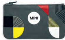
MINI SMALL GRAPHIC POUCH

Material: 100% cotton (waxed) Lining: 100% polyester Sage/Multi-coloured 80 21 5A51682 20 x 11 cm