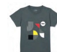
MINI GRAPHIC WORDMARK T-SHIRT KIDS

65% polyester, 35% cotton Chili Red OS (53 cm) 80 16 5A51680