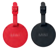
MINI LUGGAGE TAG

100% polyester (recycled PET) Sage/Multi-coloured 80 23 5A51698 Length: 82.2 cm Handle: 13.5 x 3.3 cm Diameter: 99.5 cm