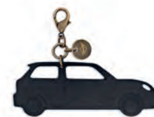
MINI CAR CHARM

Charm: 100% leather (recycled) Carabiner with MINI Wing Logo pendant Black 80 23 5A51692 10 x 3.8 cm