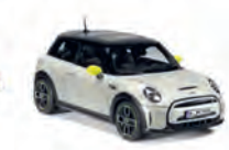
MINI COOPER SE MINIATURE

Plastic Box of 24 in 3 colours (Electric Blue, Volcanic Orange, Chili Red) 80 44 2447939 1:36 scale