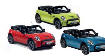
MINI CONVERTIBLE COOPER S MINIATURE

Die-cast Chili Red 80 43 5A21536 Island Blue 80 43 5A21537 1:18 scale