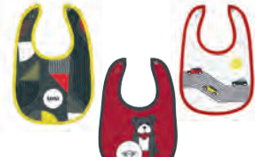
MINI GRAPHIC BIBS GIFT SET

100% cotton (organic) Sage 98-140 80 14 5A21647-54 Chili Red 98-140 80 14 5A21656-63