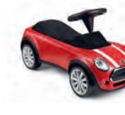
MINI BABY RACER

Aluminium Chili Red 80 93 5A21521 Length: 92 cm Height: 76 - 110 cm